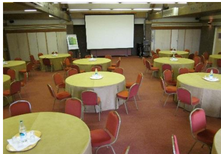
Conference Centre – Cabaret Style